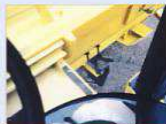
Patented fast lock system.

Cheval poly-header transporters are designed to withstand the requirements of contractors, large acreage farmers and those land layout necessitates a high mileage for harvesting equipment.